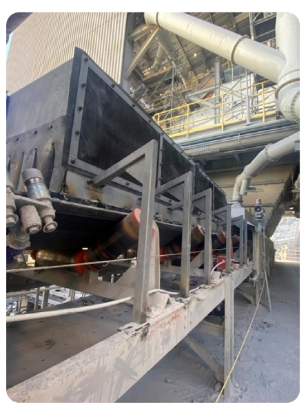
The DustScrape dust emission prevention system consists of a filter cloth, support arches and skirts, arms to hold the system above the belt and a rubber curtain to eliminate further dust development.