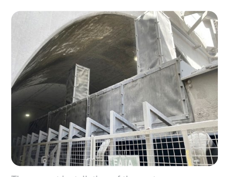
The correct installation of the system ensures optimum performance.

"An important feature of this system is that DustScrape and AirScrape operate without energy consumption. In addition to substantial operational cost-savings, our customer has been able to eliminate the need for conventional dust collectors that demand high energy cosumption."